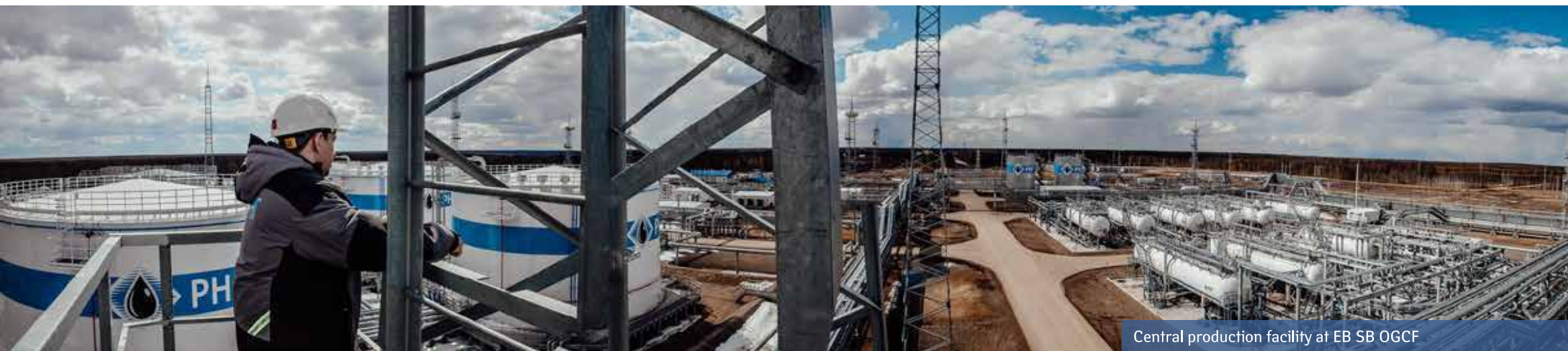
Central production facility at EB SB OGCF