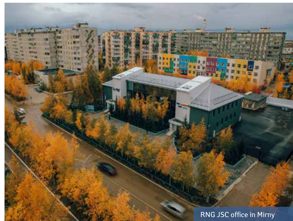
RNG JSC office in Mirny

RNG JSC in its activities relies on the principles of sustainable development and measures success not only by financial and production indicators. The company fulfills all the obligations in the field of social responsibility.