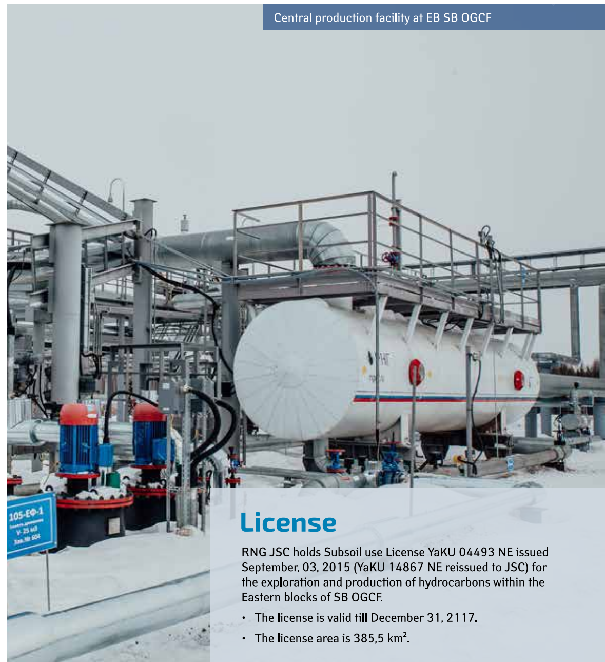
Central production facility at EB SB OGCF

The problem is to be solved with a substantial contribution of the ESPO oil pipeline and the Power of Siberia gas pipeline, which is located at a distance of 150 km from the Eastern blocks of the Srednebotuobinskoye field.