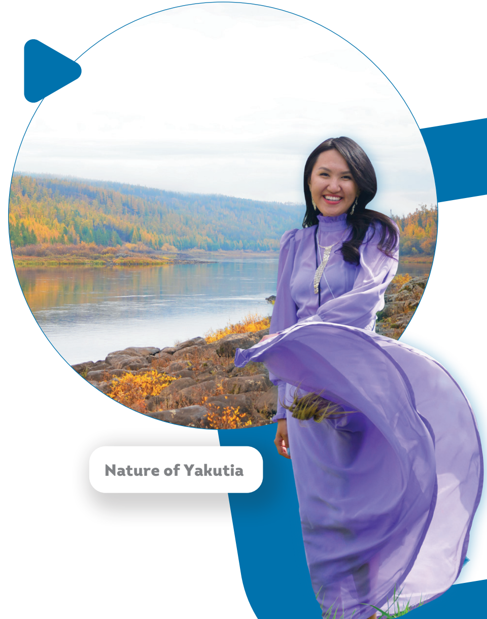
Nature of Yakutia

The Company is growing fast, moving outside its primary region of activity and scope of operations, bolstered by innovative technology and wise management decisions.