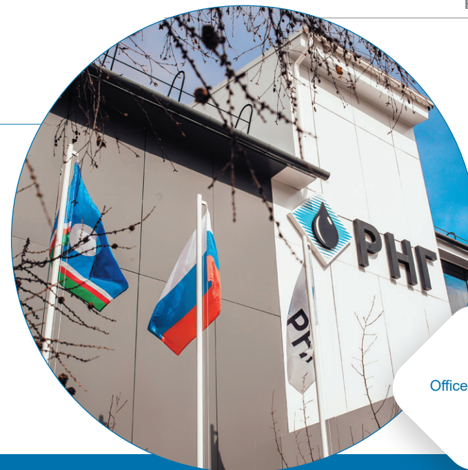
Office in Mirny